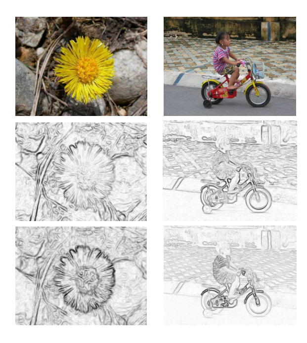
Figure 3: Comparison for edge detection. Top row: Original images. Middle row: RGB color edges. Bottom row: color-boosted edges. RGB edges are more biased by luminance.

proach to extend existing detectors to color is to compute the derivatives of each channel separately and then combine the partial results. However, combining the first derivatives with a simple addition of the separate channels results in cancellation in the case of opposing vectors, and the same situation occurs for second-derivative operators. To overcome this problem, Di Zenzo [13] proposed the color tensor defined as