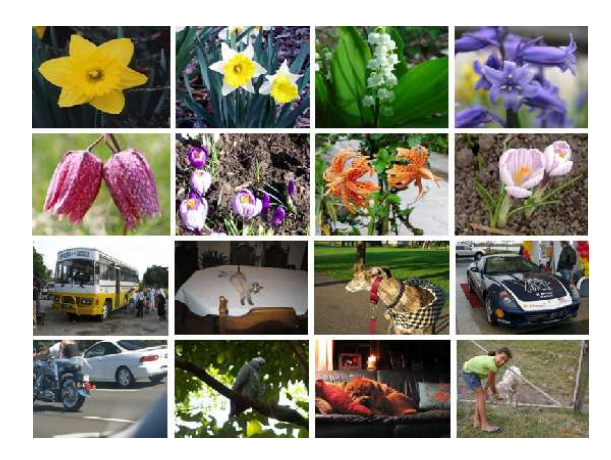
Figure 4: Example from the two data sets The top two rows show images from the Flower data set and the bottom two rows provide examples from the Pascal VOC 2009 data set.

Implementation Details: In our experiments we use the detectors proposed in section 2 together with a multi-scale Grid. The SIFT descriptor is used to create a shape vocabulary and the Color Names and HUE descriptors are used to create color vocabularies. We abbreviate our results with the notation convention CA (descriptor cue, attention cues) where CA stands for Color Attention based bag-of-words. In our experiments we use a standard nonlinear SVM with a \chi^2 kernel for the Flower data set and intersection kernel [4] for the Pascal VOC 2009 data set since it requires significantly less computational time, while providing performance similar to that using a \chi^2 kernel. We tested our approach on two different and challenging data sets,