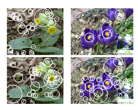
Figure 1: Top row: Laplacian-of-Gaussian and Harris Laplace based on luminance. Bottom row: Laplacian-of-Gaussian and Harris Laplace based on color boosting. The color boosted detector focuses on the more informative features. Only the fifty strongest detected regions are depicted. The radius of the circles indicates the scale selected.

The aim of feature detection is to find discriminative regions in images. Most existing methods only use the shape saliency as a criterion for detection, which is extracted from the luminance information. However the use of color information could lead to the detection of